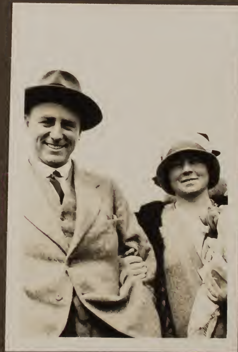
Tisbury May 26 th 1928